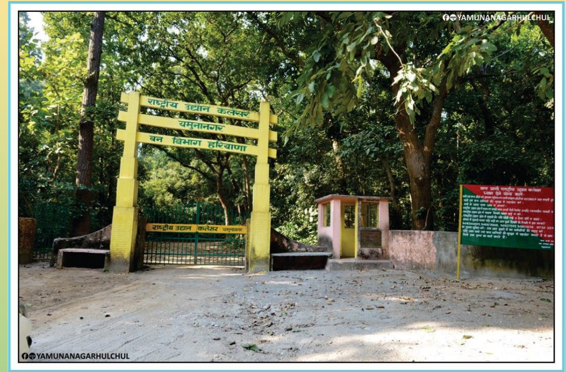
Kalesar National Park