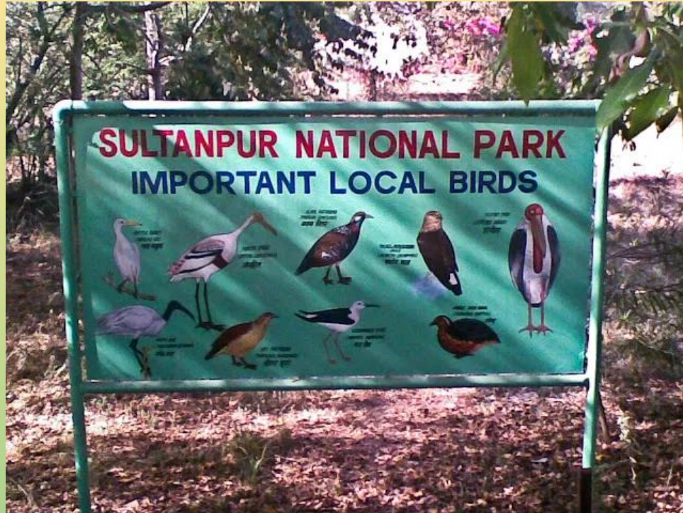
Sultanpur National Park